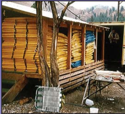
and front porch shipping