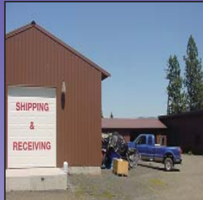
to 8000 Sq. Ft. and our very own loading dock.